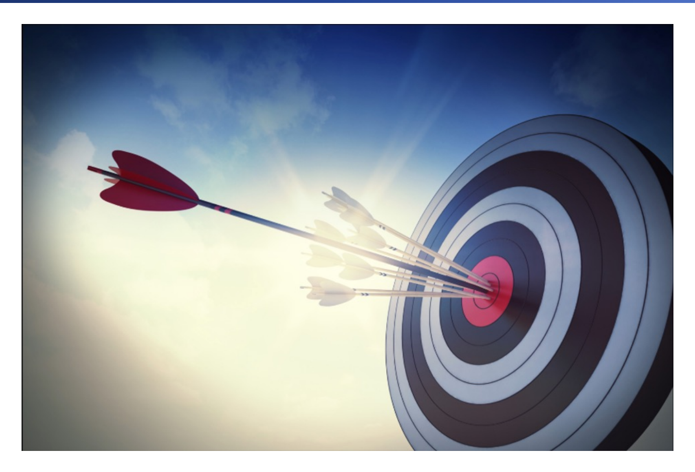
AN EQUITABLE RESULT FROM AN EQUITABLE PROCESS